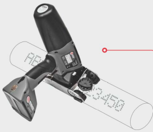
Model P512151 Printing the long axis of pipes or other cylindrical surfaces

Stabilizer guide brackets for printing on cylindrical surfaces for assisting with perfectly straight lines