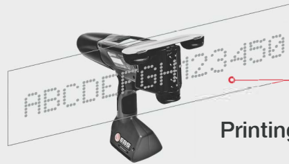
Model P512130 Printing straight messages on flat surfaces