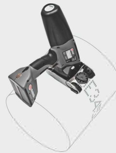
Model P513085 Printing the short axis of pipe, barrels, or other cylindrical surfaces