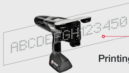
Model P512130 Printing straight messages on flat surfaces