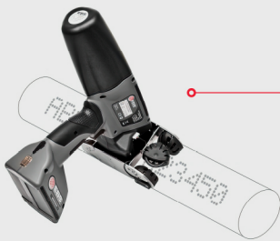
Model P512151 Printing the long axis of pipes or other cylindrical surfaces

Stabilizer guide brackets for printing on cylindrical surfaces for assisting with perfectly straight lines