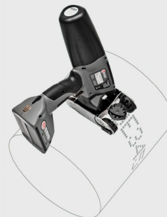
Model P513085 Printing the short axis of pipe, barrels, or other cylindrical surfaces